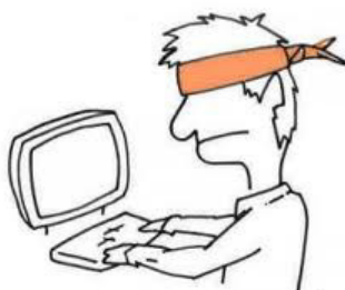
A TEC operative updates the Funding Rules & Conditions

So what does this mean for you? Well we have found a solution which will allow you both to keep on using code “8” for RPL and to report code “8” for Te Reo theses. All will be explained in due course.